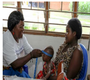
Physical examination stations