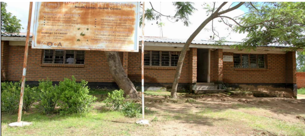
MACHINJIRI OUTREACH CLINIC

In this regard Dream Malawi has partnered with ABC to adopt a light model through which high quality PMTCT services will be provided in public maternity wards displaying poor PMTCT care results. The partnership will also support the maternity with transport, equipment and training of health staff who will be working at the maternity unit.